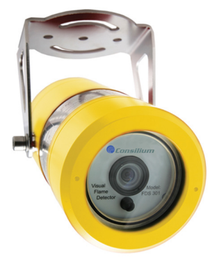
Visual Flame Detector

Each CD-F-301 incorporates an on-board Micro-SD card capable of recording 17 seconds of the alarm video – 8.5 seconds pre-alarm and 8.5 seconds post-alarm. This video recording proves invaluable during incident analysis and more crucially, you will never have an unknown alarm.