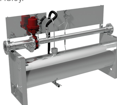
System with Connection to Fire Water Pump

System with pressurized water vessel and local foam supply. Water are stored inside a pressure approved vessel. When water is needed, the vessel will be pressurized and water will be driven out by compressed air stored in high pressure cylinders. The cylinders can be recharged without be replaced as an option.