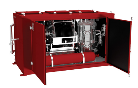
DAHR With Cabinet

Generally installed in open deck areas, walkways, and escape routes, a Firenor firewater hydrant is the ultimate piece