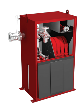
Hydrant with Foam Tank

Firenor can provide heated or unheated cabinets for storage of one or more extinguishers when required.