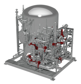
Sprinkler with Water Vessel