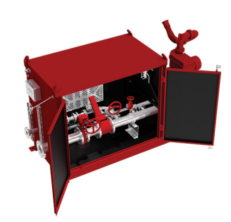
Monitor with Cabinet