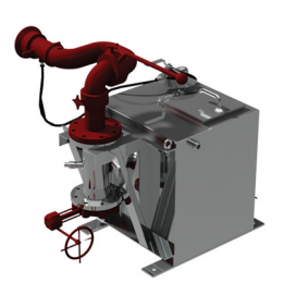
Monitor on Frame