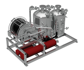
DAHR on Frame